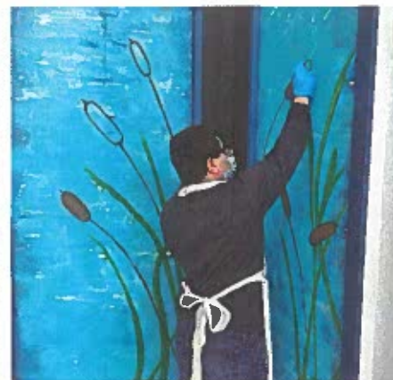
Clients in the Itasca Life Options program were instrumental in designing and painting the outside of Dragonfly Coffee.