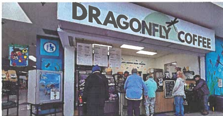
Located in the center of the mall, Dragonfly Coffee offers a vast variety of hot and cold beverages and plenty of sweet and savory fresh bakery treats.